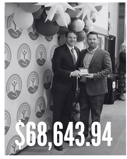
ARGENT FINANCIAL GROUP