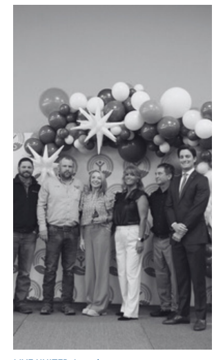
LIVE UNITED Award ENTERGY LOUISIANA