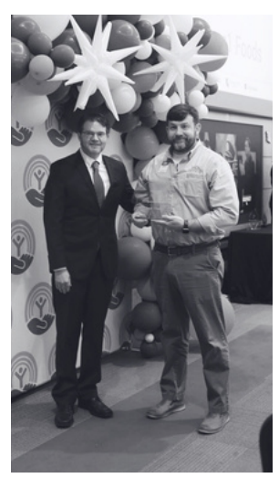
VolunteerUNITED Award SUPER 1 FOODS