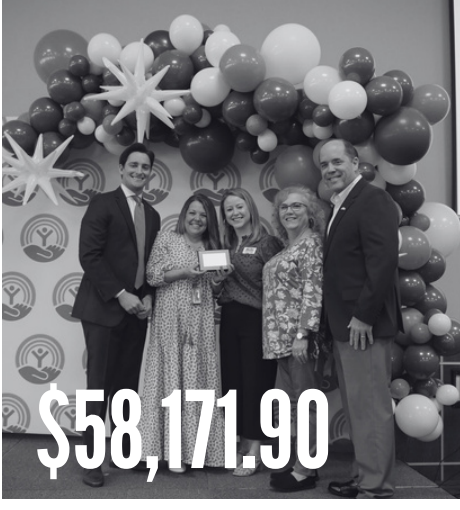
BRONZE OUACHITA PARISH SCHOOL BOARD